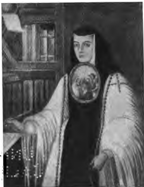
From the painting in the Convent of S. Jerónimo, Mexico City